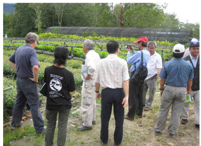
Field test in Sabah conducted in forest plantations of Sabah Forests Industries (SFI) Sdn. Bhd., Sipitang