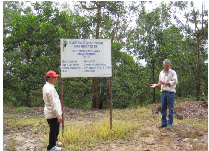
Field test in Sarawak conducted in forest plantations of Sarawak Planted Forest Sdn. Bhd., Bintulu