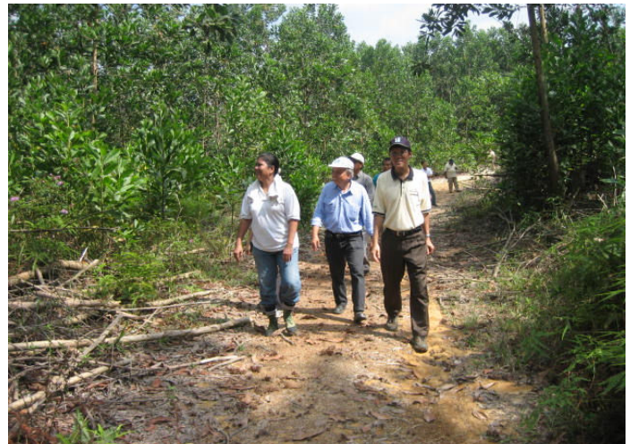
Field test in Peninsular Malaysia conducted in forest plantations located in the Kemasul Forest Reserve, Mentakab, Pahang

Please access the MTCC website with regard to the milestones in the development of the MC&I(Forest Plantations) .