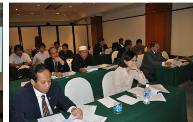
Regional Consultation in Kuala Lumpur