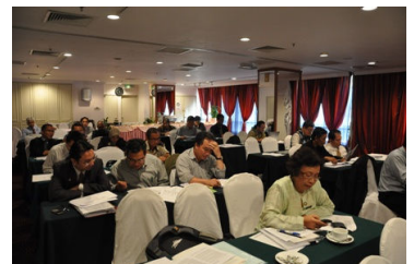
Regional Consultation in Kuching