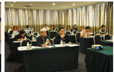
Regional Consultation in Kota Kinabalu