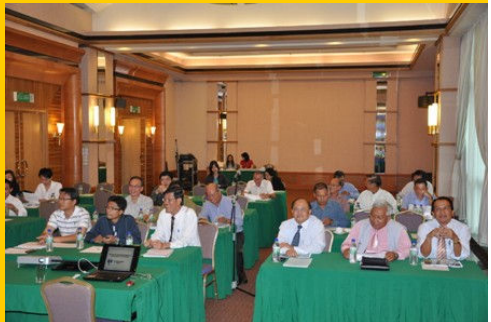
Participants during the briefing session

MTCC conducted a briefing on the standard for certification of forest plantations under the MTCS i.e. MC&I(Forest Plantations) for members of the Sarawak Timber Association (STA) in Kuching on 25-26 January 2010.